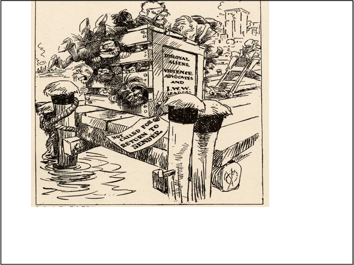
Mar 7-8:57 AM