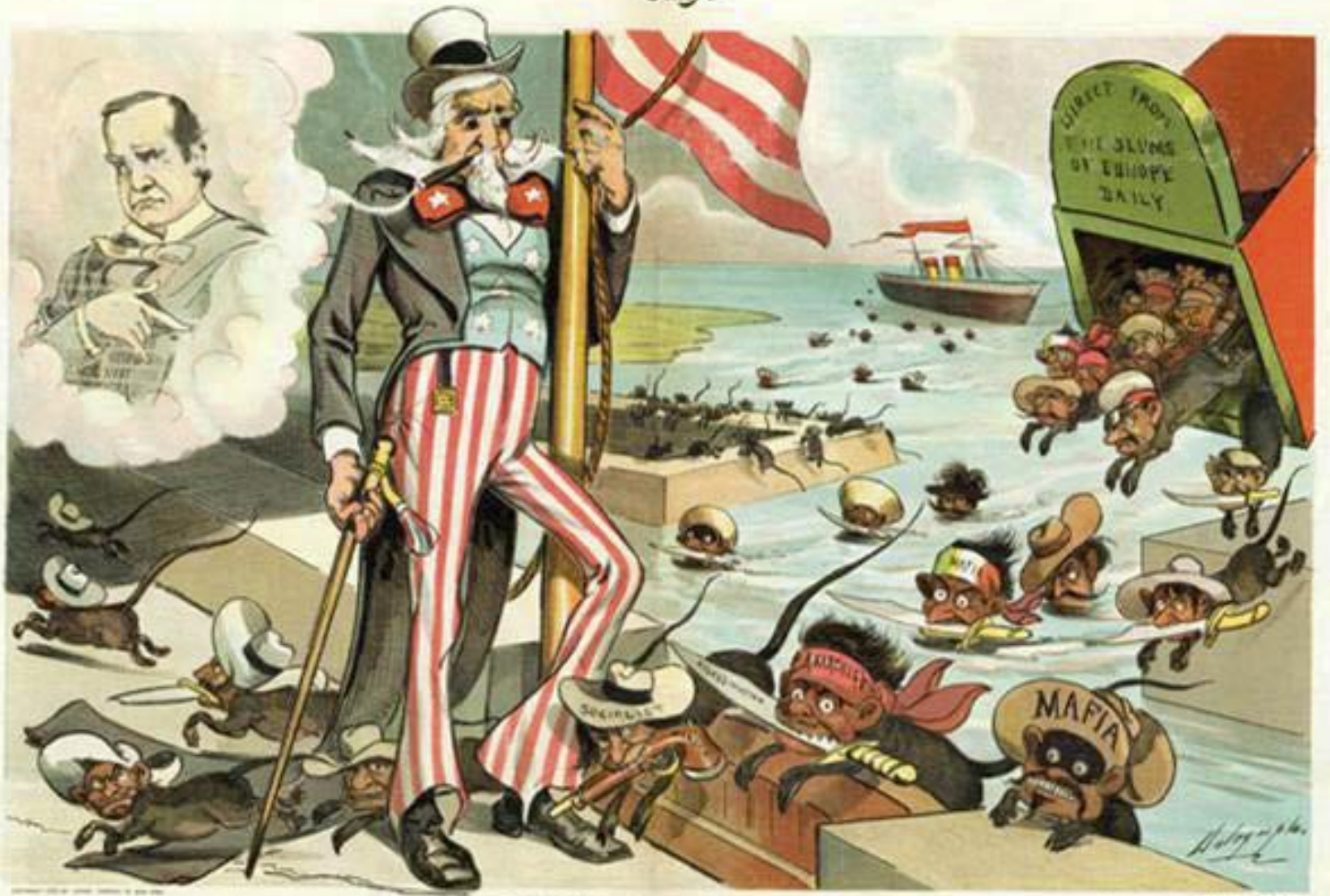
THE UNRESTRICTED DUMPING-GROUND.