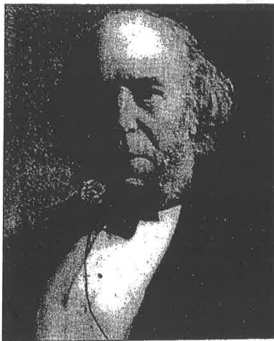
Herbert Spencer (1820–1903) applied Charles Darwin's ideas about evolution to society. He believed that keeping government limited would ensure the "survival of the fittest."

Darwin's theory inspired Spencer to write more books, showing how society evolved. With the financial support of friends, Spencer wrote more than a dozen volumes in 36 years. His books convinced many that the destiny of civilization rested with those who were the "fittest."