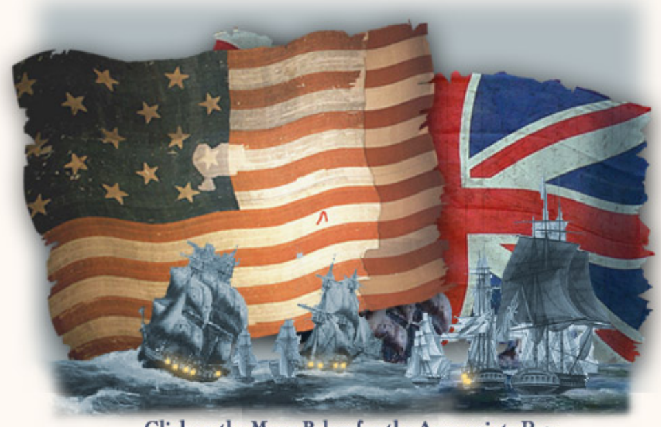
Click on the Menu Below for the Appropriate Page